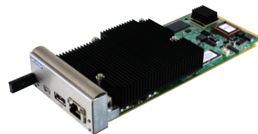
MIC-5602A2-M2E with Full-Size Front Panel